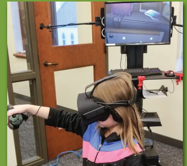
Virtual Reality Launch Party | October 2018

[right] In fall of 2018, the Library unveiled its new mobile Virtual Reality carts. 129 participants of all ages experienced VR for the first time!