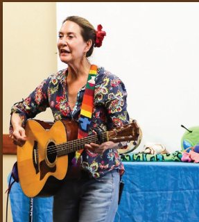
Hunk-Ta-Bunk-Ta Performing | June 2018

[left] Local children's band Hunk-Ta-Bunk-Ta played for a packed house during the Summer Reading Program Kick-Off Party.