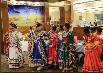
Día de los Muertos Celebration | November 2018

On Sunday, November 4, the Library celebrated its Fourth Annual Día de los Muertos (Day of the Dead) celebration, in partnership with the Museum and several other local sponsors. The day's events included Mariachi singers, traditional Aztec and other dancers, sugar skull decorating, face painting, other family activities . . . and plenty of Mexican food for all to enjoy!