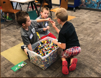
Sensory-Friendly Storytime | September 2018

In September, the Children's Department hosted a "Sensory-Friendly" Lego night aimed at supporting children on the autism spectrum. Some of the accommodations included reducing the amount of overall stimulation by lowering the lights, reducing the number of people in the space, and ensuring neutral color. According to a survey of the participants, it was a big success and they would like to see it hosted again!