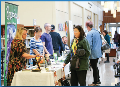
Local Authors Showcase | November 2018

On a Saturday in November, the Library hosted its Fourth Annual Local Authors Showcase. To continue our passionate advocacy for literacy and lifelong learning, the library brought together a community of new and established authors, small business owners, publishing companies, e-book authors, local writers groups and avid readers. Fifty local authors were able to showcase their crafts, network with others in the publishing field, and sell their goods directly to the book-loving public.