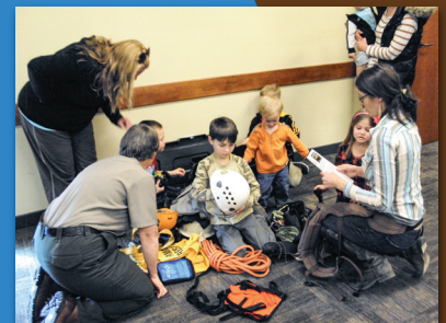
Rocky Mountain Rangers Program | March 2018

[right] What do Park Rangers do? On March 12, kids found out as they talked to a park ranger from Rocky Mountain National Park about his occupation.