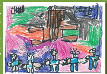
Drawing by Ponderosa Elementary student

2018 marks the second year of the Thompson School District First Grade visits. Eleven TSD elementary schools visited between October - December. Prior to the visits, staff spent 20 hours created over 500 new student library cards! One student's thank you card [left] read, "Thank you for giving me my own library card. I love the book that you read to me, it was super fun! This library is the best library in the world!"